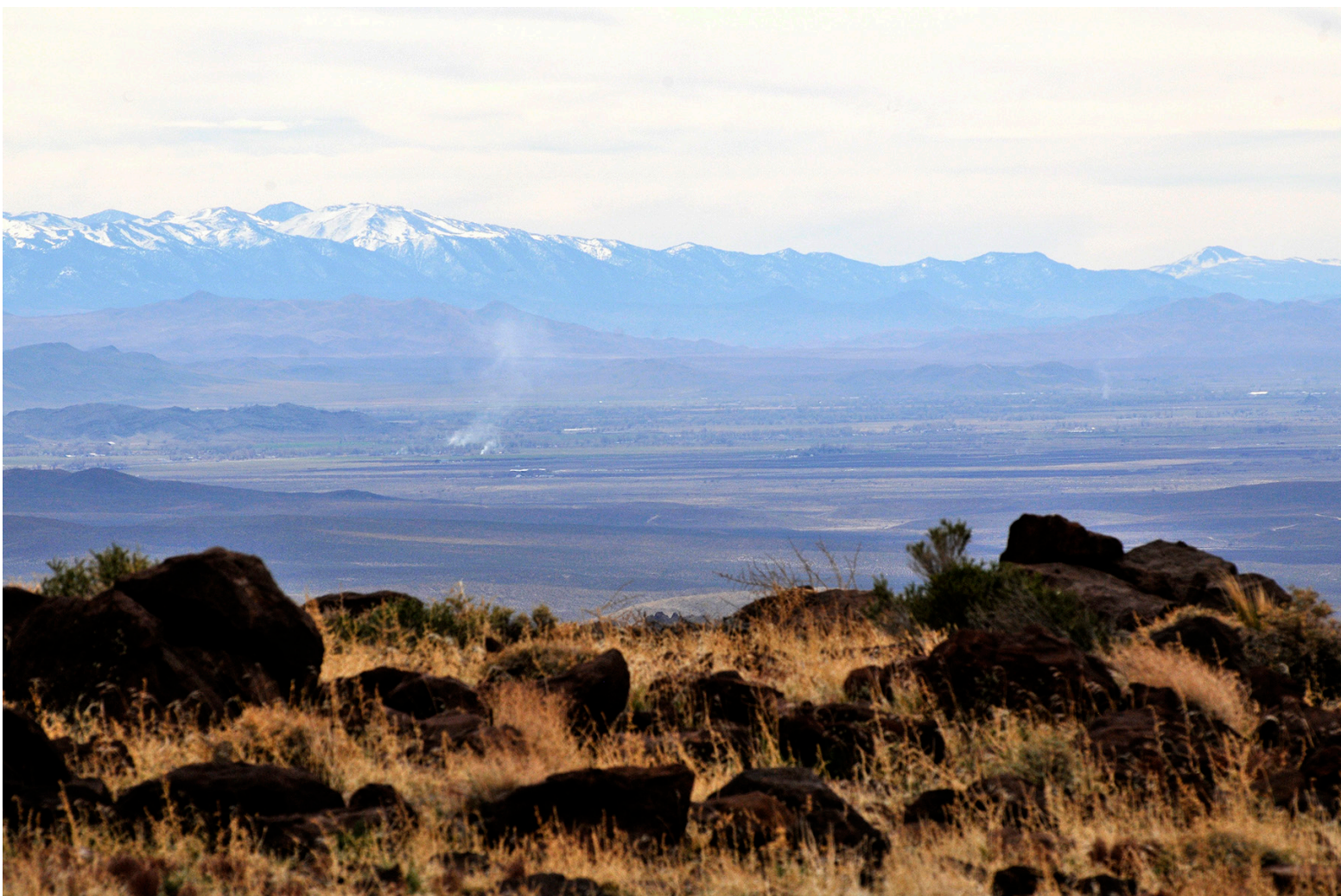
View south from Fremont Lookout at Mason Valley.