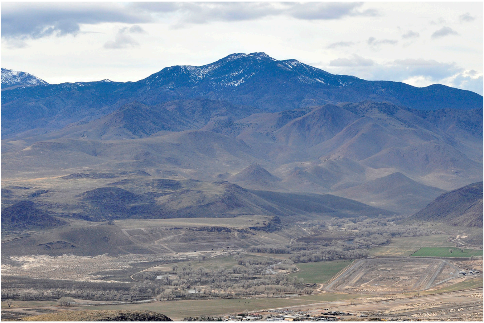
View southwest from Fremont Lookout towards the Carson River and the Pine Nut Mountains. Photo by Jack Hursh, 2016