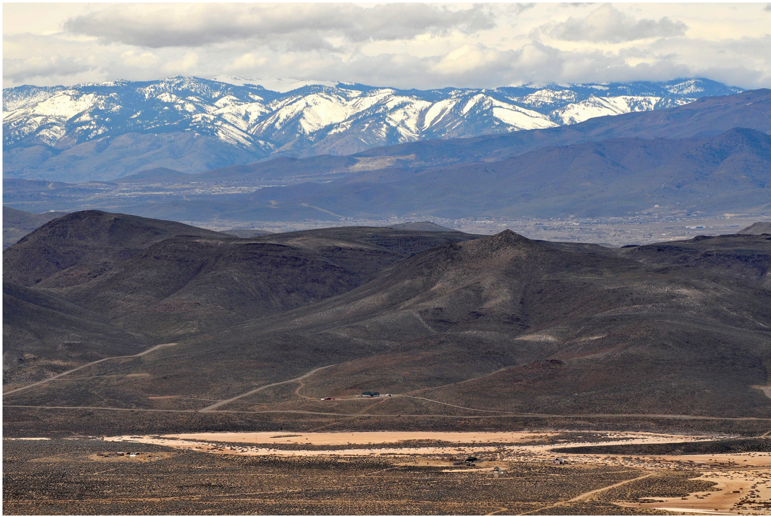
View west from Fremont Lookout towards Dayton Valley beyond the first ridge with the snow-covered Carson Range in the distance. Photo by Jack Hursh, 2016